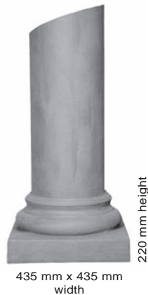
Square 250 Pipe I/D